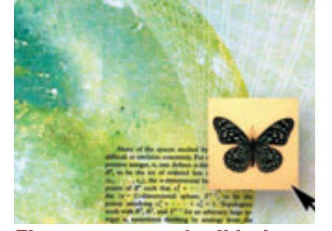
The structure of wikis is shaped from within-not imposed from above.

instructional strategies, and capture suggestions. Educational Technology Coordinator Jim Sibley reports: "The ability to spawn whole sites or a series of pages astonishes people when they first see it.... You can quickly map out pages to cover all aspects of complex processes or projects."4