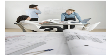
From school to work!

SEEK: POST-GRAD SCHOLARSHIPS UP TO $100,000.