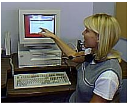
Voice Recognition System