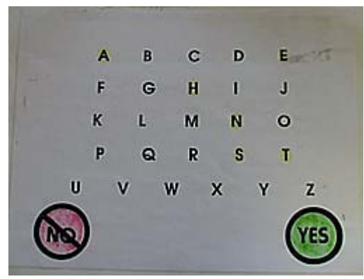
A simple communication board

Low-tech = devices that are non-electronic, generally use simple electronic designs (if any at all), are low cost, are simple to use, and require little or no formal training to effectively operate. Low, or light tech as some will refer to this class of devices, can often be fabricated by school personnel, family members, or friends.