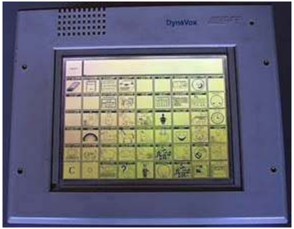
A Communication Device

High-tech = devices that are electronic, driven by a computer, generally expensive (over $1,000), and are complex, often requiring more in-depth knowledge and skills to operate effectively. High tech devices are rarely fabricated by persons other than those with extensive knowledge in electrical circuitry, mechanics, and programming.