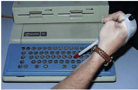
A writing template for the computer