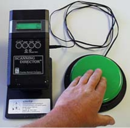
An Environmental Control Unit

You will frequently find persons relying more on low tech, even those who use high tech devices. Why?