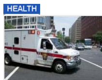
D.C. ambulances get life-saving technology

USO's United Thru Reading program: Va. Tech, UVa. alumni face-off in book challenge