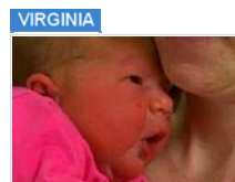
911 dispatcher helps mom give birth on side of Culpeper County road