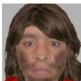
Suspect tries to abduct woman in Woodbridge