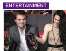
The Twilight Saga: Breaking Dawn Part 2 review