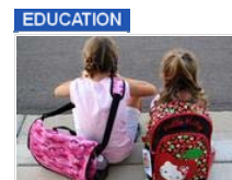
D.C. Schools closing: Parents, others protest slated closures

D.C. Area Weather Forecast: Still chilly but no storms